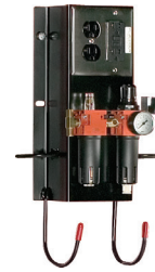
Air electric work station

2' column height extensions accommodate higher profile vehicles